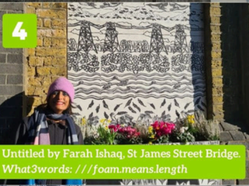
Untitled by Farah Ishaq, St James Street Bridge. What3words: ///foam.means.length