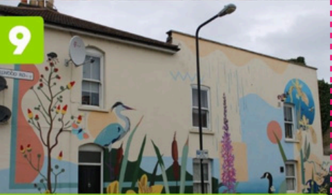
Wetlands /mural by Hixxy, Hazelwood Road. What3words: ///glue.poppy.chips