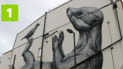
Badger by Roa, Crate, St James Street What3words: ///hung.rang.lion