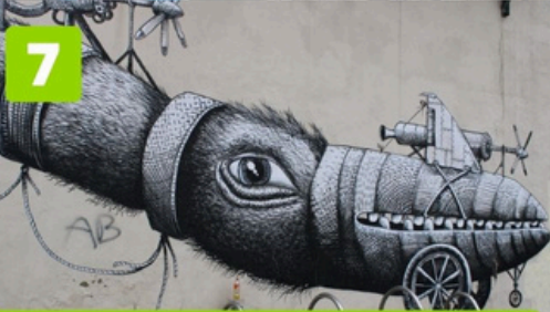
Avroplane by Phlegm, St James Street. What3words: ///boots.sunset.palace