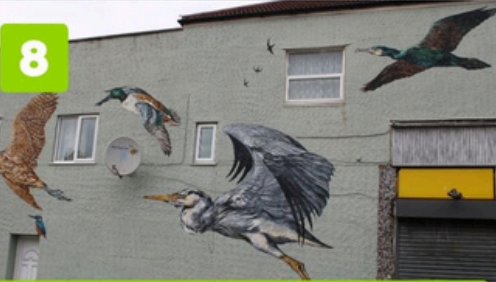
Birds by ATM, Coppermill Lane. What3words: ///goes.random.asset